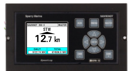
NAVIKNOT CONTROL AND DISPLAY UNIT (CDU) IN A CONSOLE FRAME