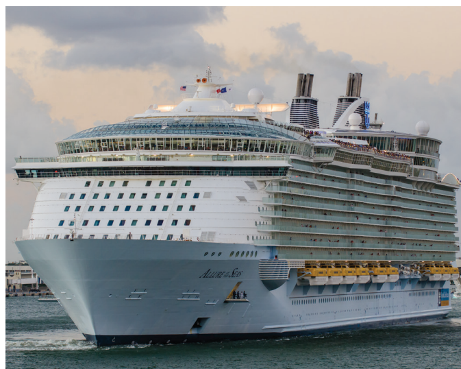
The Royal Caribbean cruise ship, the Allure of the Seas, equipped with a NAVIPILOT 4000