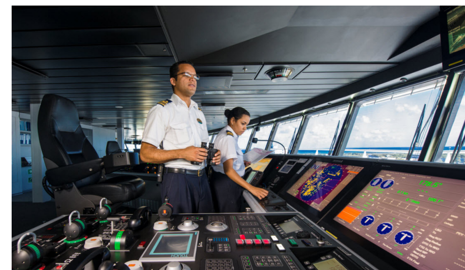
INTEGRATED NAVIGATION AND BRIDGE SYSTEMS FOR EASY OPERATION

Our NAVIKNOT Multi-sensor Speed Log series comprises a uniquely flexible range of speed log systems, for use on all types of vessels. We deliver Speed Logs from electromagnetic sensors, Doppler transducers to satellite sensors offering flexibility and to meet requirements for all types of vessels.