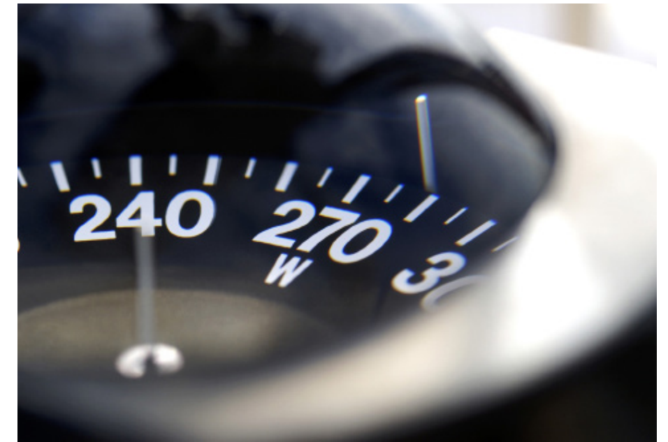
CHOOSE FROM A WIDE SELECTION OF MAGNETIC COMPASS SYSTEMS TO MATCH YOUR NEEDS

Our Autopilot and Steering Control systems include the NAVIGUIDE 4000,